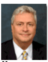
House Speaker Allan Bense

The new House structure includes 10 councils containing 35 committees.